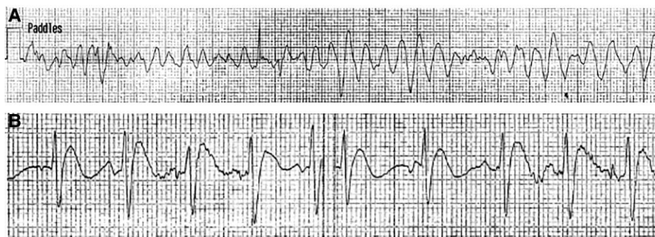
Figure 1 (A) Polymorphic ventricular tachycardia and (B) Type-1 Brugada pattern.